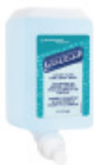
KIMCARE® Luxury Foam Hair and Body Wash 91553 An all over body showering lotion with luxury foaming action and a conditioner that leaves hair feeling soft.