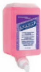
KIMCARE GENERAL® Luxury Foam Skin Cleanser with Moisturisers 91552 A premium quality foam hand cleanser suitable for most washrooms. Gives a rich lather and leaves your hands feeling clean, fresh and cared for.