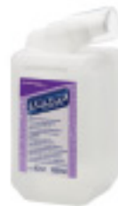
KIMCARE GENERAL® Frequent Use Foam Soap 6342 Contains no dyes or fragrance, reducing the risk of skin irritation and making it safe for food handling applications. Recommended for frequent hand washing applications.